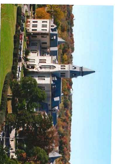
Kansas State University