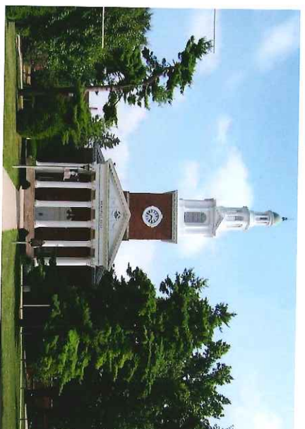
University of Kentucky