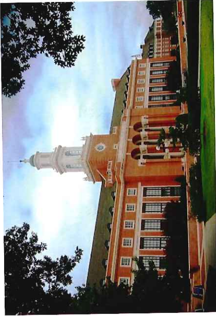
Oklahoma State University