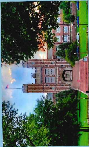
Washington University in St. Louis